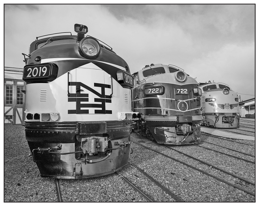
Three units posed for attendees at the North Carolina Transportation Museum's "Streamliners at Spencer" on May 30, 2014.

A severe shortage of pipeline capacity by next year is expected to cause rail shipments of oil to triple in western Canada in a couple of years.