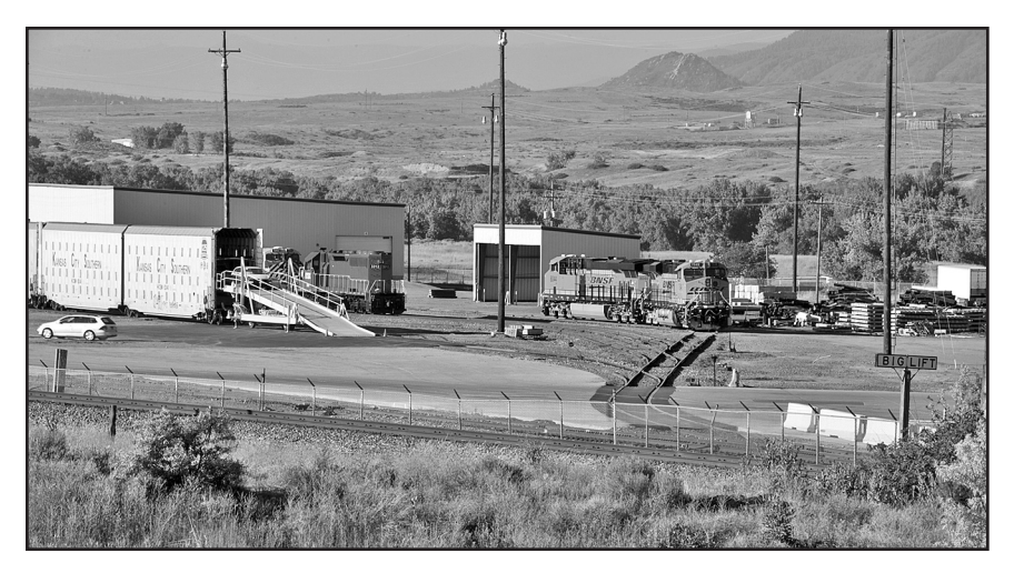
BNSF's Auto Unloading Facility opened June 1, 2014, along the Joint Line at Big Lift, Colorado, south of Littleton. Atchison, Topeka and Santa Fe (ATSF) built the Big Lift Intermodal facility. In recent years BNSF had Savage subcontract the facility as a transload operation. Savage has now moved to Irondale at Commerce City, Colorado. ITSX 3312, SD40-2, (red unit next to auto unloading ramp) is assigned to switch Big Lift. BNSF and leased CitiRail units are based at Big Lift as Joint Line helpers.